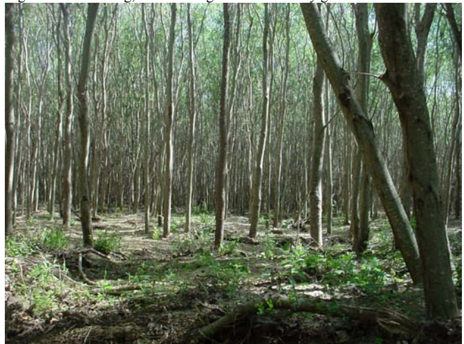
Fig 12 Riparian forest, after storms 2007-2008. Sediment in channels.