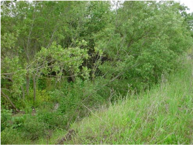
Fig 21. Small willow choking center of channel.