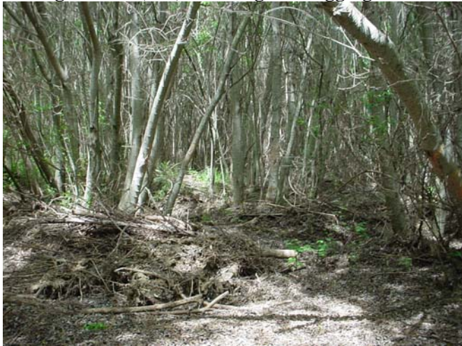
Fig 9 Riparian forest before thinning.