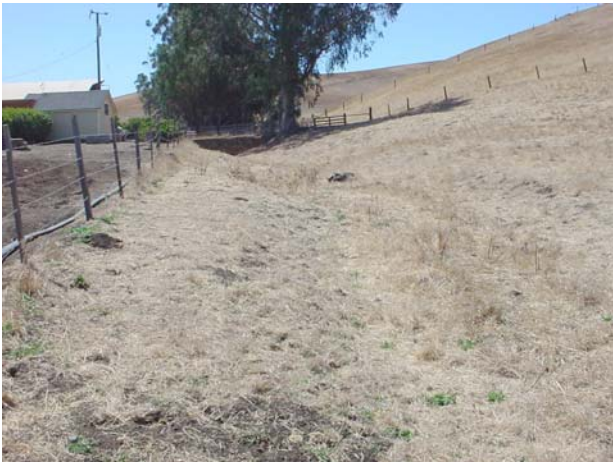
Fig 19 Downstream plugged outlet of historic stone culvert.