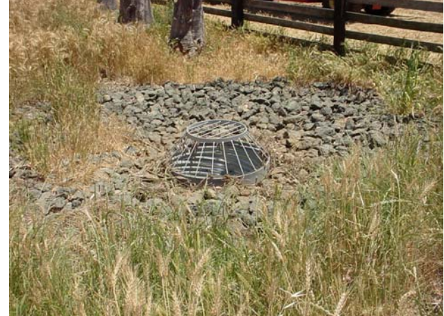
Fig 18. View of inlet and grate, late Spring.