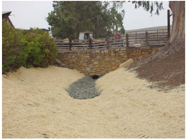
Fig 20 Capacity of outlet restored, channel sediment used for fill Upstream, energy dissipation at outlet, reseeded and mulched.