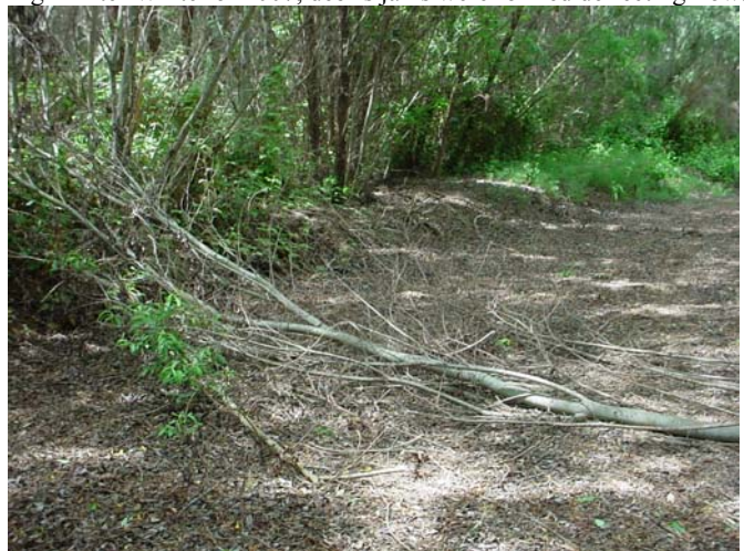
Figs 5 & 6. A Few of the fallen trees in Los Osos Creek in Wetland Reserve Program easement area.