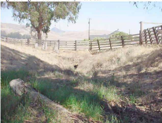
Fig 15 From upstream view of filled in channel and head cut.