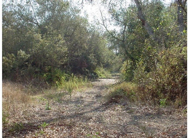
Figs. 1 & 2. Los Osos Creek in May 2007 had just a few trees fall after the mild winter and little or no rainfall producing no flow in this reach. Same reach 10/22/2007 after trimming on 9/28/2007.