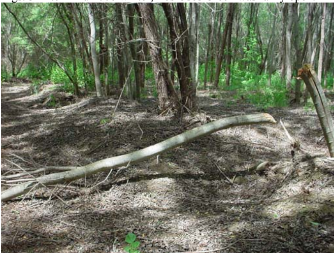
Fig 4 After Winter of 2007, debris jams were formed deflecting flow.