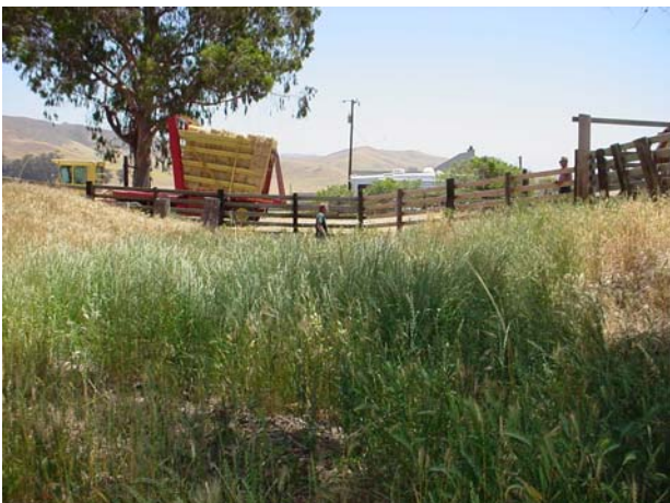
Fig 17. Late Spring view from upstream of project. Planted cover caught debris flowing through channel (lower left of picture)