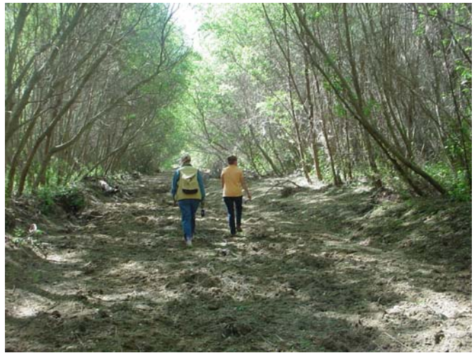
Figs 7 & 8. Los Osos Creek this spring after debris and fallen tree removal, several large storms and some extensive wild pig activity.