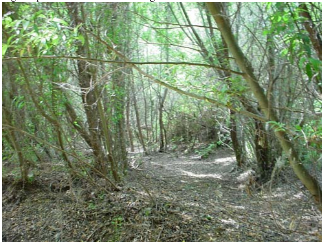
Fig 11 Riparian forest channel before additional thinning.