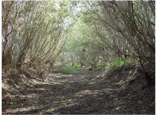
Fig 22. Small willow pruned and thinned, shady canopy cover intact.