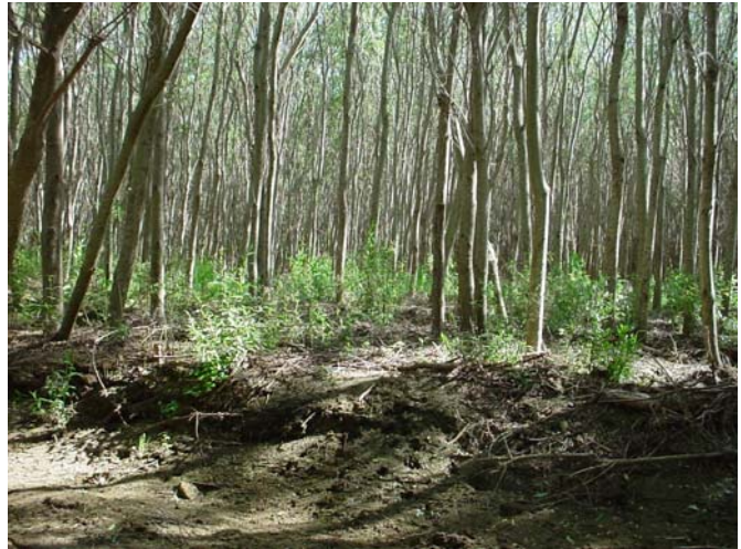
Fig 10 After thinning, increased light and understory growth.