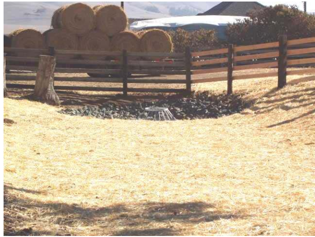
Fig 14 Inlet after project. Culvert and historic stonework protected.