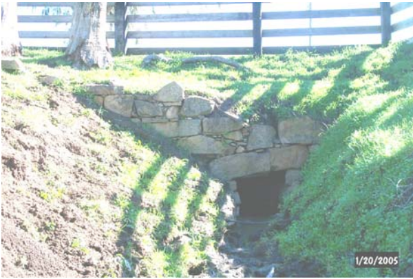
Fig 13. Original Stone culvert, inlet side.