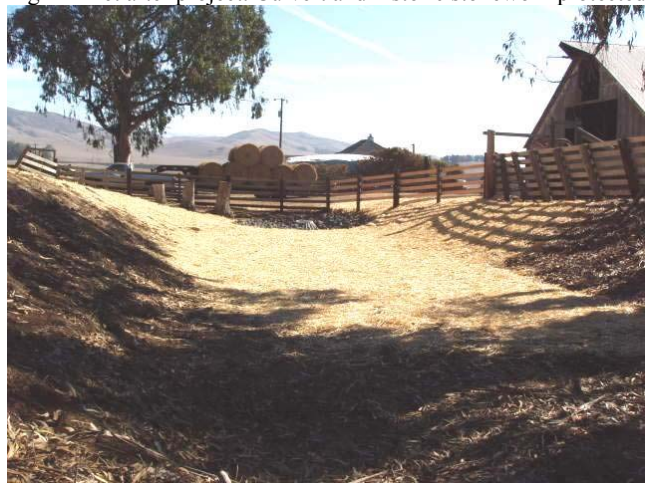
Fig 16 Channel smoothed and inlet installed to stop head cut erosion